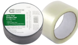
2). 2" Vinyl Electrical Bundling Tape, silver or 2" packing tape.

Reduce the edges of the board by rolling the ERT Tool along the edge. Apply the necessary pressure to make sure the edge is reduced about 1/8 of an inch.