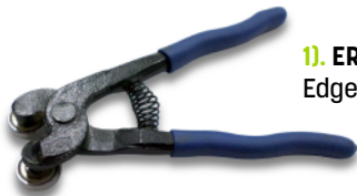
1). ERT Tool Edge Reduction Tool

ERT tool is used to evenly crimp the edges of the board to facilitate the installation of the connectors. Tape is also recommended to keep the edges thickness reduced during handling and transportation.