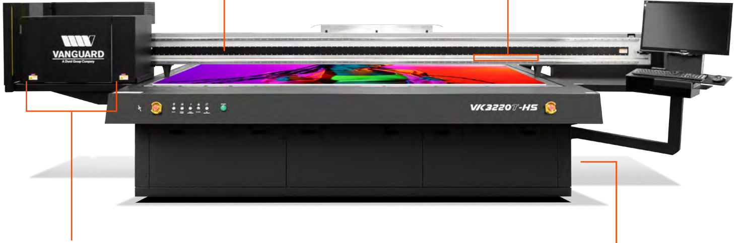
STATIC SUPPRESSION BARS TAKK in Cincinnati, Ohio