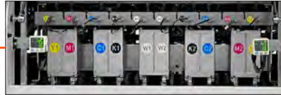
Ink Pumps KNF in Germany